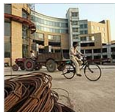
India, Suddenly Starved for Investment