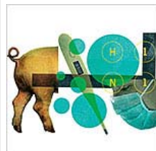
Worry? Relax? Buy Face Mask? Answers on Flu