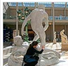
Americana at the Metropolitan Museum