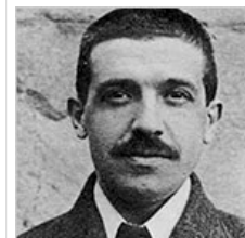
Manuscript Sheds Light on the First Ponzi