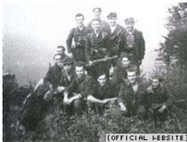
UPA rebels pictured in 1947